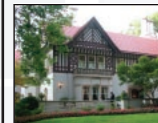
Callanwolde Fine Arts Center

A crowd of 300 was on hand for Youth V.I.B.E.'s Seventh Annual Awards Banquet and Birthday Celebration held August 15th at the Callanwolde Fine Arts Center. The celebration- Viva Youth V.I.B.E. - commemorated the non-profit's successful youth programs and celebrated individuals instrumental in the organization's growth.